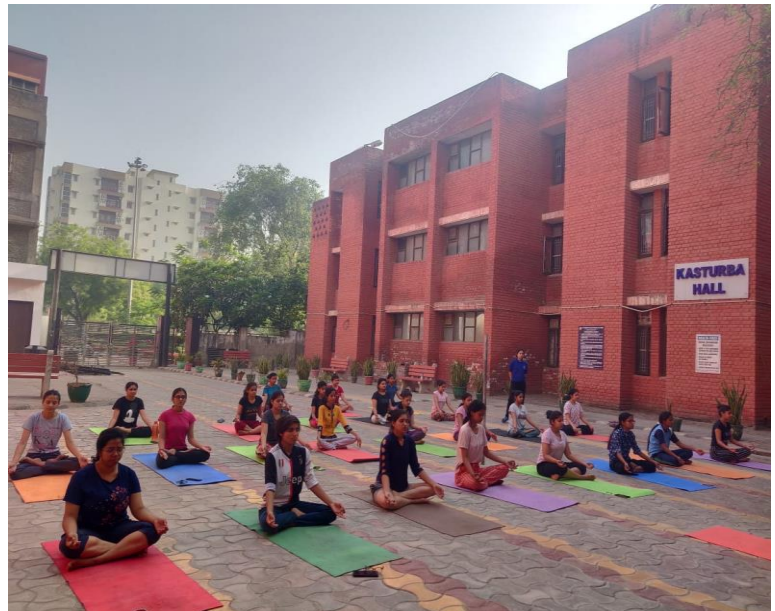
Glimpses of Some Events Organized in the Girls Hostel