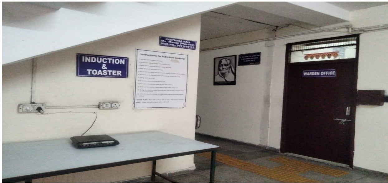
Glimpses of Some Facilities in the Girls Hostel