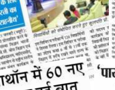
विद्यार्थियों को प्रोत्साहित करने के लिए विज्ञान भारती का प्रयास सततनवीय।

विद्यार्थियों में विज्ञान के प्रोत्साहन के लिए विज्ञान भारती का प्रयास सततनवीय