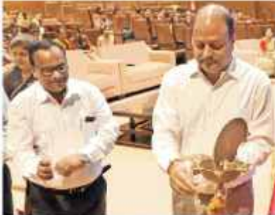
जम्मू के जेसी बोस विश्वविद्यालय में आयोजित जेसी बोस युनिवर्सिटी का स्वर्ण जयंती समारोह।