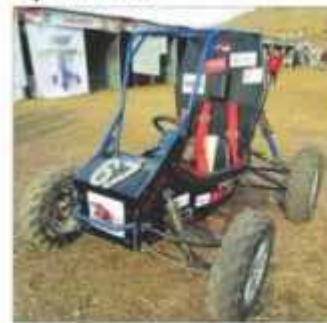
prize-winning ATV designed and developed by students.