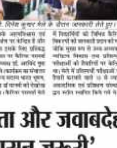
‘प्रौद्योगिकी एवं सुशासन’ विषय पर व्याख्यान आयोजित।

‘प्रौद्योगिकी एवं सुशासन’ विषय पर व्याख्यान आयोजित