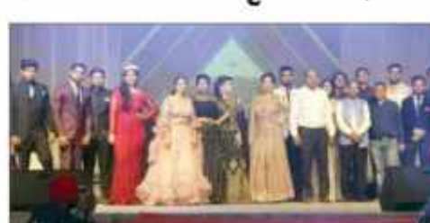
विद्यार्थियों का रंगरंगीत में भारतीय पारम्परिक परिधानों और संस्कृति की झलक दिखाना।

फरीदाबाद, 24 नवम्बर (ब्यूरो): जेसी बोस विज्ञान एवं प्रौद्योगिकी विश्वविद्यालय, फरीदाबाद के विद्यार्थियों ने भारतीय पारम्परिक परिधानों और संस्कृति की झलक दिखाई।