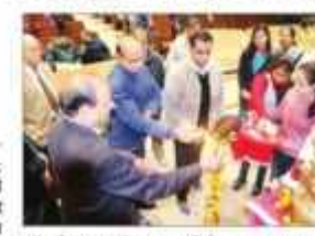
एच नवीनराम अनुसंधान अकादमी के फॉल्लोअप में वीएलएसआई डिजाइन पर कार्यशाला का प्रारंभ।

तकनीक सीखने के लिए विद्यार्थियों को प्रेरित करना है कार्यशाला का उद्देश्य