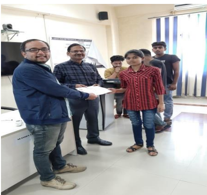
Students getting certificate after successful completion of workshop.

Civil Engineering Department of J.C. Bose University collaborated with REC, Ambedkar Nagar and organized jointly a five days workshop at REC Ambedkar Nagar, College Campus. In this event, 65 students got benefitted from this workshop in which 13 was from J.C. Bose University.