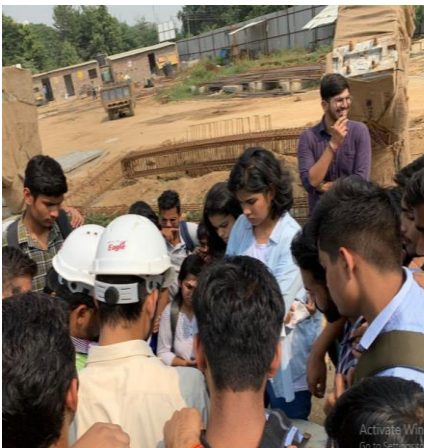
Students of civil engg. at Site Visit

An industrial visit was organized by the department where the students of the department visited the Raja Nahar Singh Stadium, Faridabad. In this Event students actively took part and got the opportunity to learn in this event.