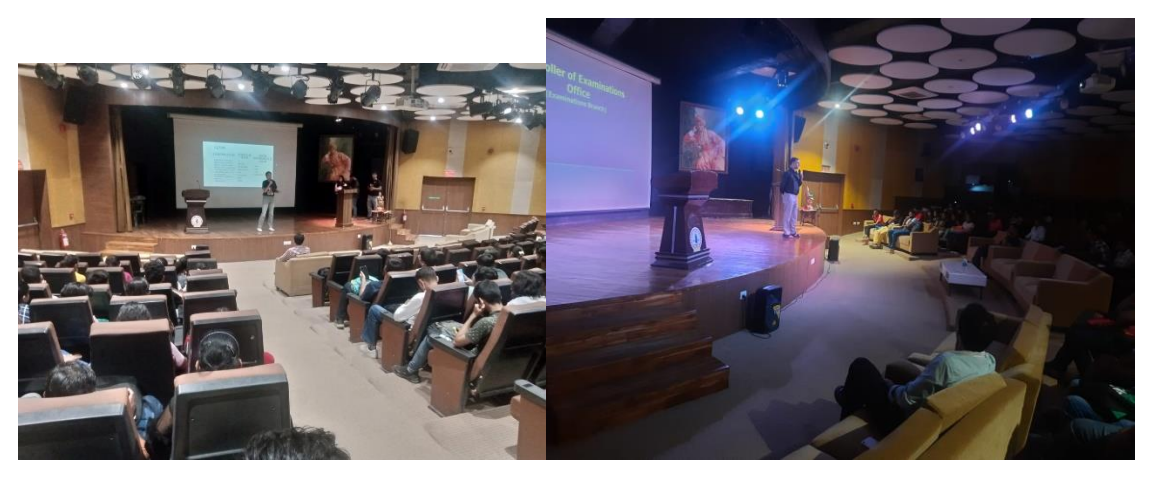
Briefing by Cultural Clubs coordinator

different departments. 4<sup>th</sup> day i.e. 21/09/2023, briefing by C &C cell, women cell, Mooc coordinator, Innovation cell, IR cell, and all cultural club's coordinator were carried out. In the afternoon bridge course classes were conducted by different departments.